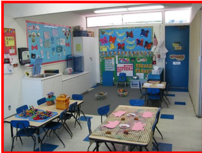
PRESCHOOL CLASS ROOM