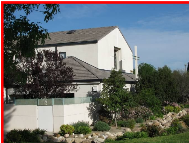
MEMORIAL GARDEN WALL & SANCTUARY