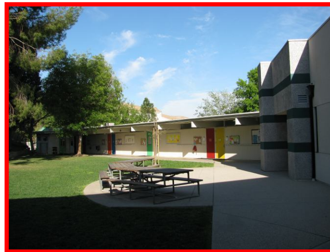
COURTYARD & SCHOOL BUILDING