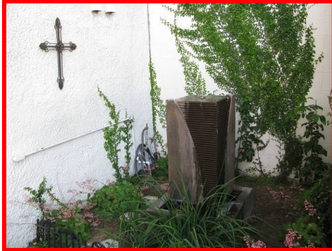
PARISH HALL FOUNTAIN GARDEN