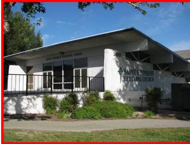
PARISH HALL UPSTAIRS (LOUNGE)