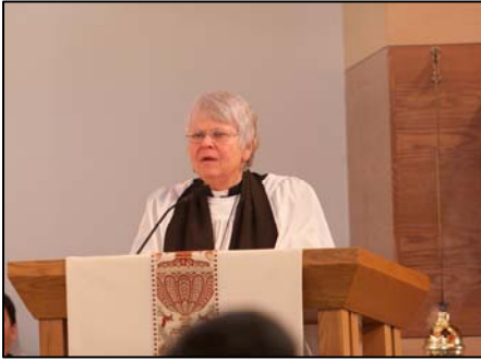
A great sermon is preached.