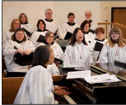
The Lessons come alive in the telling.