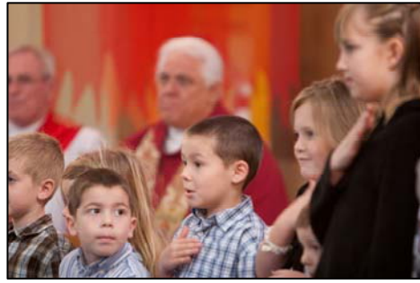
The children sing.