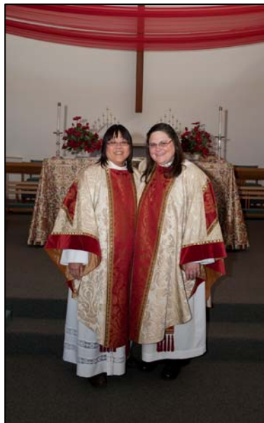
Two of their own became priests of the church. Thanks be to God. Alleluia! Alleluia!