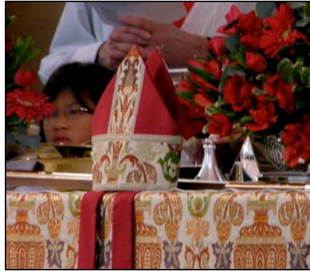
Words are spoken, bread is broken, the people fed; holy food, for holy people.